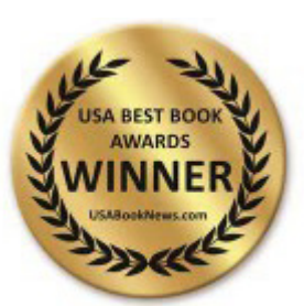
Best Cover Design and Best Children's Fiction