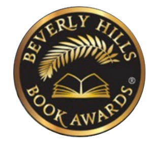
Winner in the Juvenile Fiction Category of the 3rd Annual Beverly Hills International Book Awards