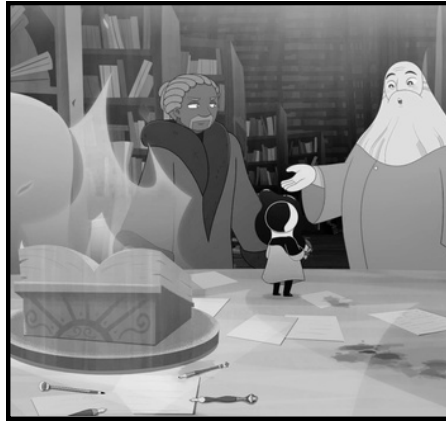
Smudge learns about the World Book and feels...