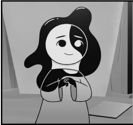
Smudge explains their story and feels...

Smudge feels lots of different emotions during their big adventure! Look at the pictures below. Think about what is happening in the story and how Smudge might feel. Write one or two words to describe Smudge's feelings in each box.